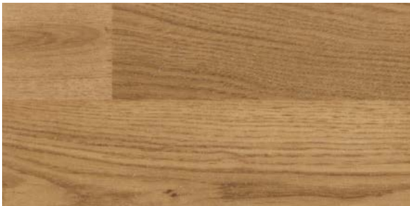
Rustic Oak 3332 plank w/l: 83 x 333/666mm