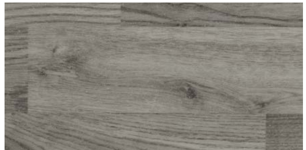
Silver Oak 3352 plank w/l: 83 x 333/666mm