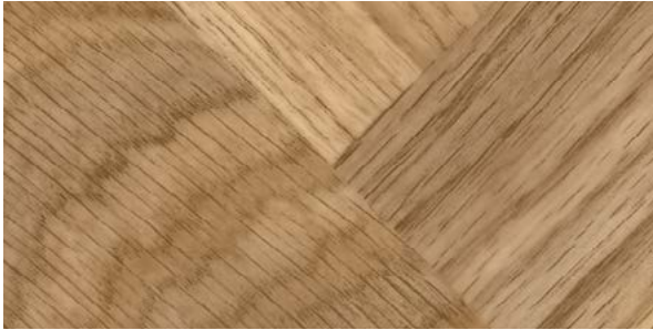
NEW Eton Oak Parquet 3399 plank w/l: 76.2 x 288.6mm