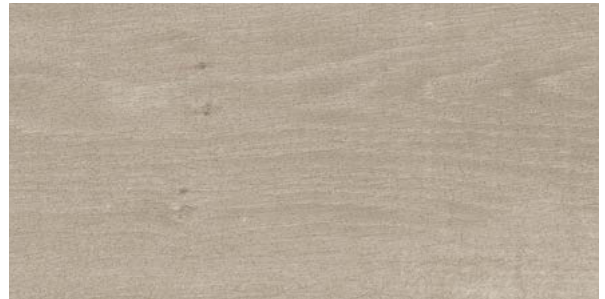
NEW Sun Bleached Oak 3384 plank w/l: 200 x 1500mm