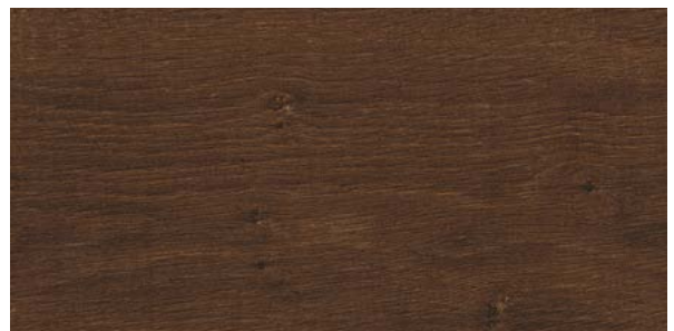
NEW Aged Oak 3389 plank w/l: 200 x 1500mm