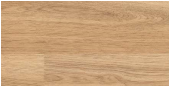
American Oak 3382 plank w/l: 100 x 1000mm