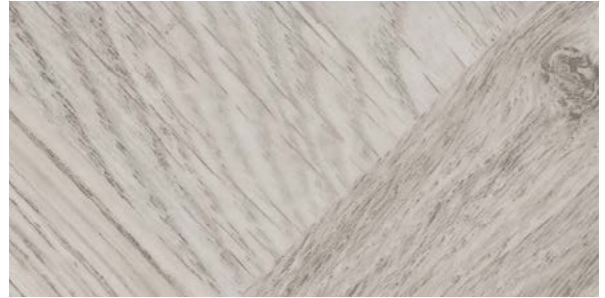
NEW Parish Oak Parquet 3398 plank w/l: 76.2 x 288.6mm