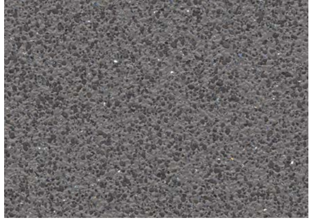
Chromite 4202 NCS S 6500-N