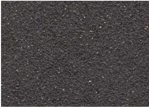
Biotite 4203 NCS S 8000-N