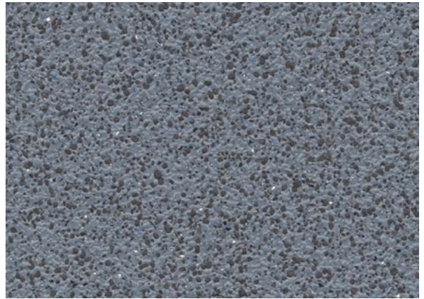
Breccia 4204 NCS S 5010-R90B