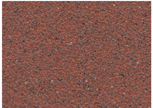
Red Ochre 4206 NCS S 5030-Y80R