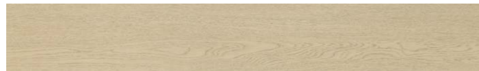
7933 Mellow Oak