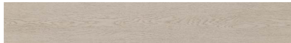
7931 Demure Blond Oak