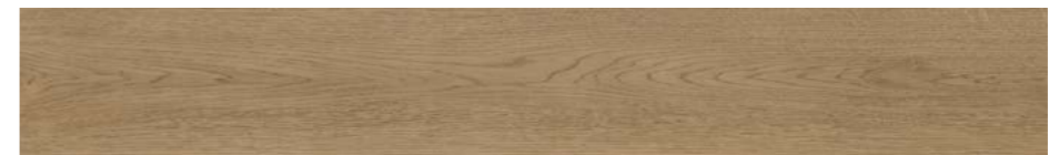
7939 Lulled Oak