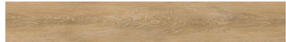
7936 Cadence Oak