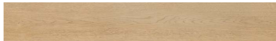
7934 Mira Oak