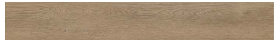
7937 Arden Oak