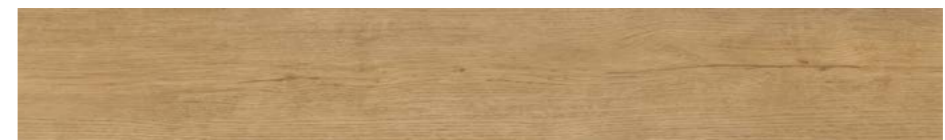
7938 Viola Oak