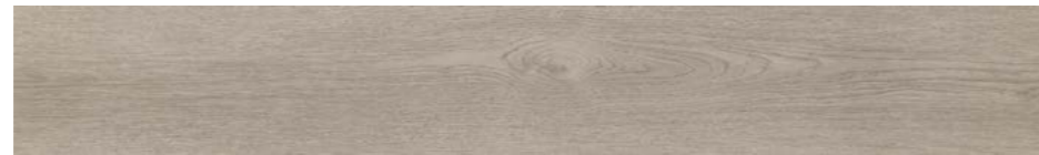
7930 Paloma Oak