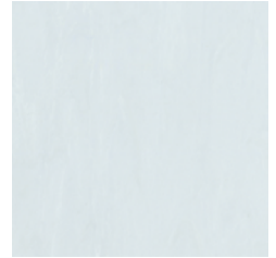
Blue Shingle 4097 w/r 4097 NCS S 1005-R90B LRV 71