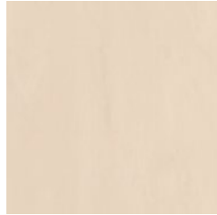
Biscuit Beige 4092 w/r 4092 NCS S 1505-Y40R LRV 62