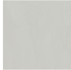
Grey Steel 4095 w/r 4095 NCS S 2500-N LRV 56