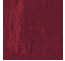
8580V w/r 8580 NCS S 5030-R LRV 9