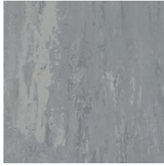
9200V w/r 9200 NCS S 4000-N LRV 32