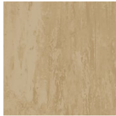
9180V w/r 9180 NCS S 3020-Y10R LRV 37