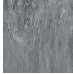
9120V w/r 9120 NCS S 4502-G LRV 28