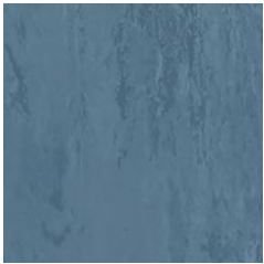
9170V w/r 9170 NCS S 4020-R90B LRV 23