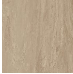
9110V w/r 9110 NCS S 3010-Y30R LRV 40