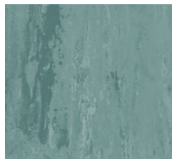
3810V w/r 2610 NCS S 4010-B70G LRV 31