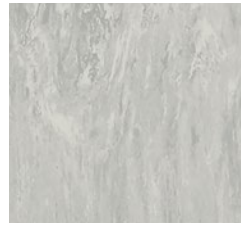
3700V w/r 2650 NCS S 2000-N LRV 54