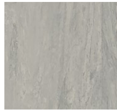
3710V w/r 3710 NCS S 3000-N LRV 41