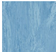
3740V w/r 3740 NCS S 2030-R90B LRV 38