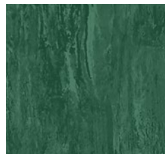
3830V w/r 2520 NCS S 6020-G LRV 14

w/r - Weld Rod LRV - Light Reflectance Value NCS - Natural Colour System