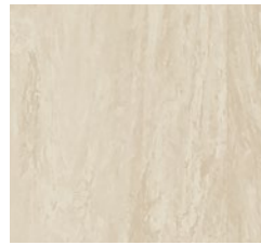
3880V w/r 3880 NCS S 1505-Y30R LRV 58