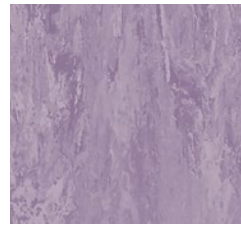
3780V w/r 3780 NCS S 3020-R50B LRV 36