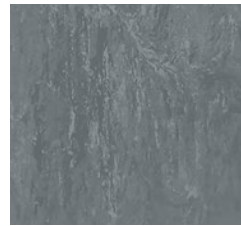
3720V w/r 3720 NCS S 5502-B LRV 25