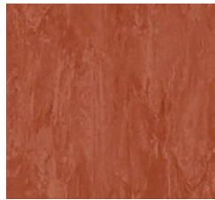
3850V w/r 3850 NCS S 4040-Y70R LRV 18