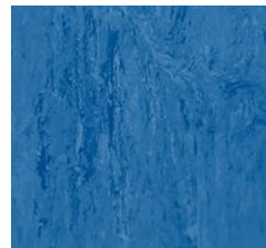
3750V w/r 3750 NCS S 4040-R90B LRV 19