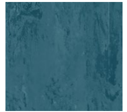
3820V w/r 2530 NCS S 5020-B30G LRV 18