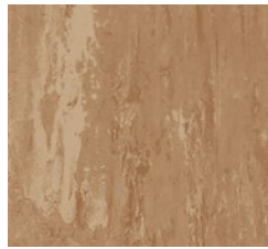
3900V w/r 2510 NCS S 4020-Y30R LRV 29