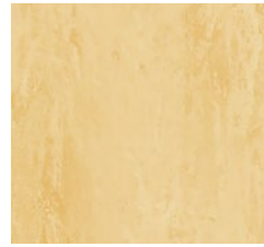
3920V w/r 2670 NCS S 1020-Y10R LRV 60