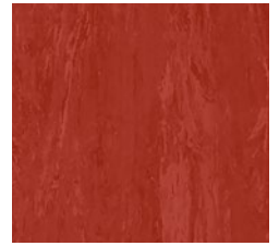
3840V w/r 2560 NCS S 3060-Y80R LRV 14