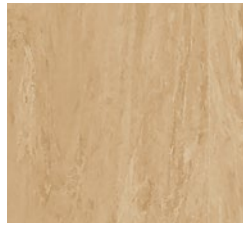
3910V w/r 2500 NCS S 3020-Y20R LRV 41