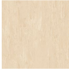
Flaxen 5060 w/r 5330 NCS S 1010-Y30R LRV 60