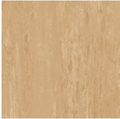
Golden Sand 5070 w/r 2500 NCS S 3020-Y10R LRV 43