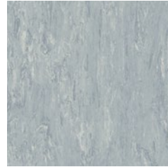
Ocean Blue 5050 w/r 5350 NCS S 3005-R80B LRV 41