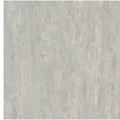
Silver Grey 5110 w/r 2090 NCS S 2500-N LRV 49